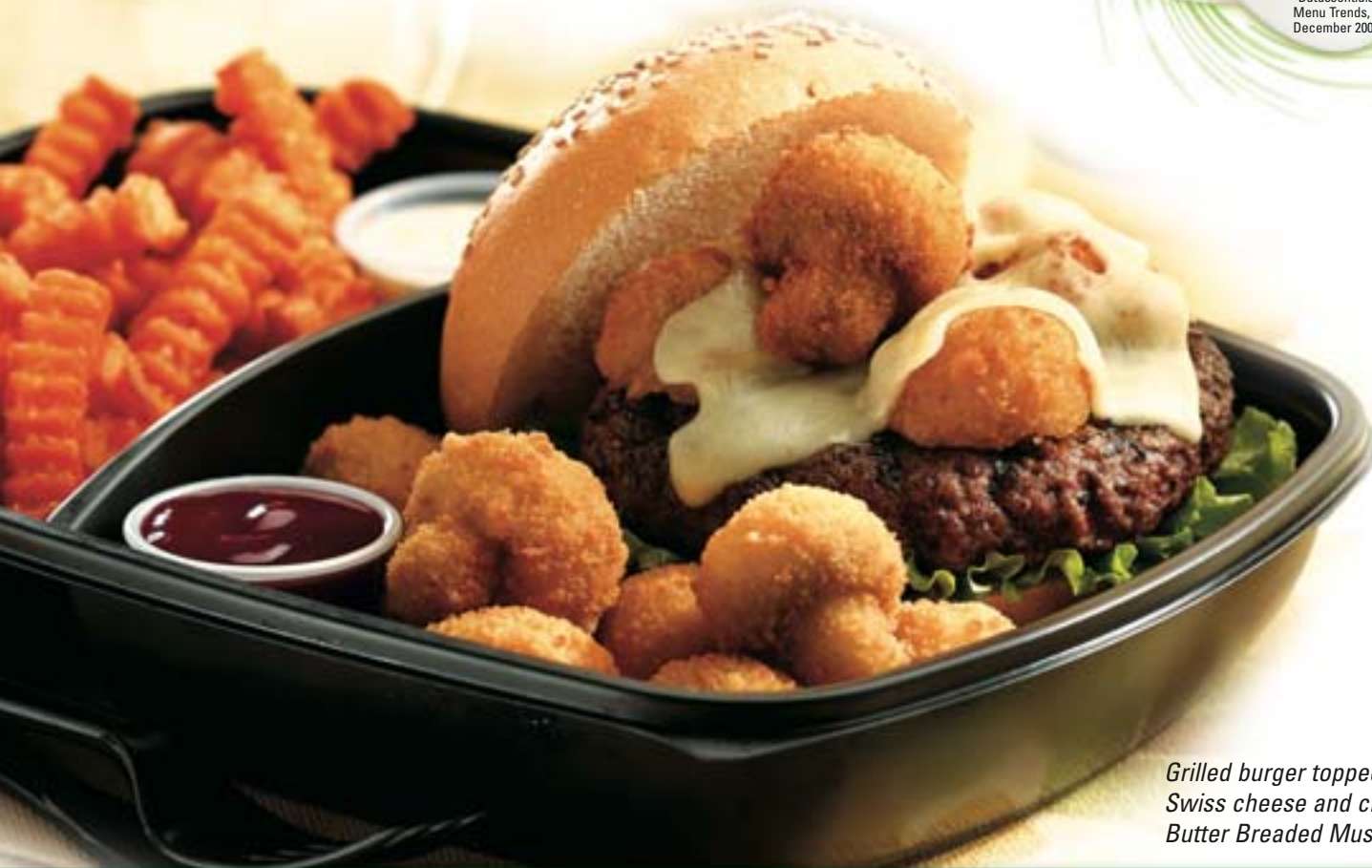
Grilled burger topped with Swiss cheese and crispy Anchor Butter Breaded Mushrooms.

1 Datassentials Menu Trends, December 2006